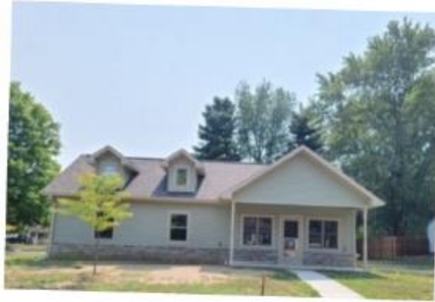
The House That Faith Built

The pandemic affected the timeline by 6 months or so, creating massive delays and elevated costs for materials. YOU came through for us, and together we raised over $20,000 in a "home stretch" virtual fundraiser to finish the house.