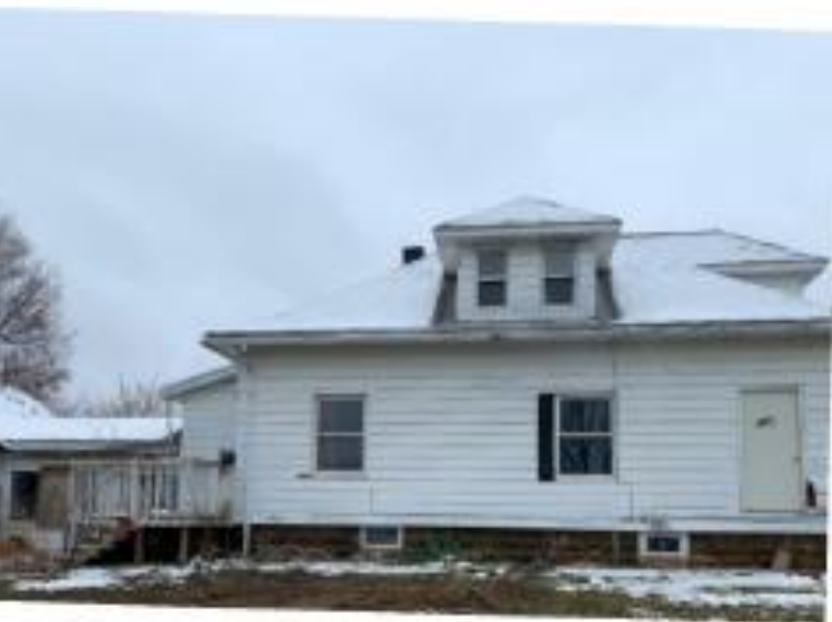
800 Hibbard Ave.